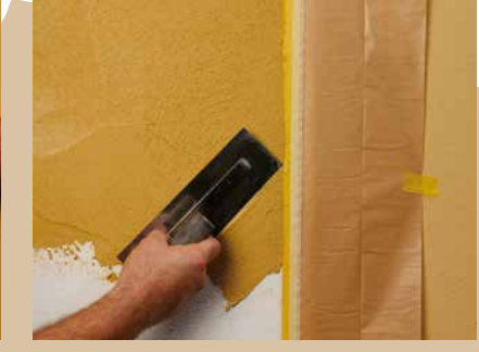
Applying the second colour