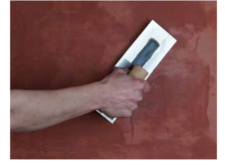
Stain filling execution