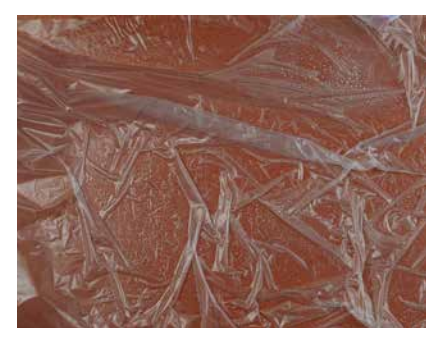
Marbled effect: film on the filler surface

Colour clay surfacer is not processed like lime filler! Colour clay surfacer is neither 'compacted' nor 'ironed' but is smoothed without applying any pressure until the desired surface look is achieved.