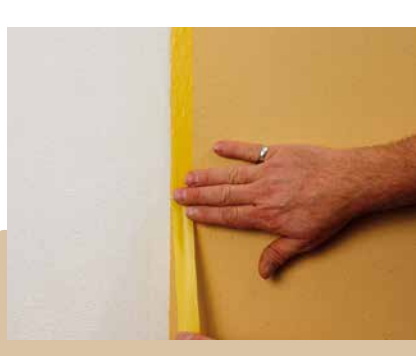
Renewed masking after drying