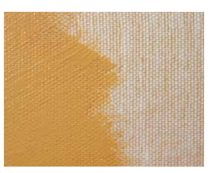
Pasting up glassfibre mesh wallpaper