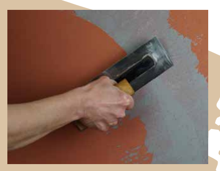
Applying the marbled topcoat