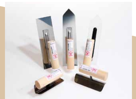
Japanese smoothing tool and fine plaster trowel, fine plastic trowel, corner trowels