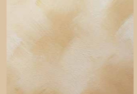
Applying the second colour