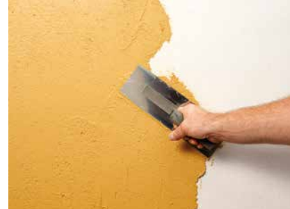
Application with the smoothing tool