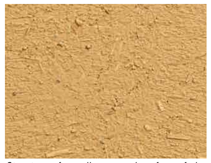
Structure of a well-prepared surface of clay undercoat plaster