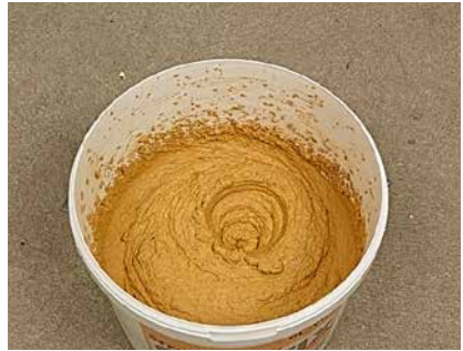
Mix well again after 30 minutes, the picture shows the consistency of ready-to-use mortar