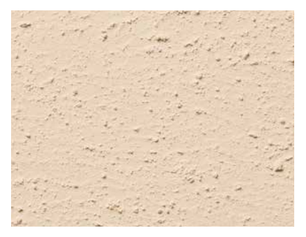
Structure of a gypsum cardboard panel prepared with YELLOW primer

Take care with old gypsum cardboard panels! The cardboard may contain yellowing substances that bleed through.