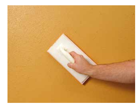
First felting treatment

Levelling off with the finishing spatula