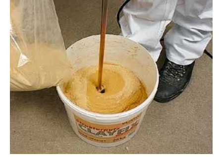
Mix the content of the bucket into water. Then leave to soak for 30 minutes.

This means that a sufficiently large tub of material has to be prepared for larger areas!