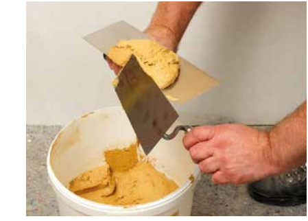
Removing the mortar

The mortar can also be sprayed on using a plastering machine. Spraying is usually used to facilitate only the application of the mortar. Information and contact addresses for various manufacturers can be found on our website www.claytec.de/service/maschinentechnik. The contacts named there have tested our products with the respective machines in practical tests and thus offer competent advice.