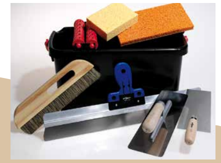
CLAYTEC offers Japanese trowels, templates and other selected professional tools.

Plaster ridges can be easily smoothed with the finishing spatula directly after application. If walls and ceilings are plastered in a room, begin with the ceiling followed by two opposite